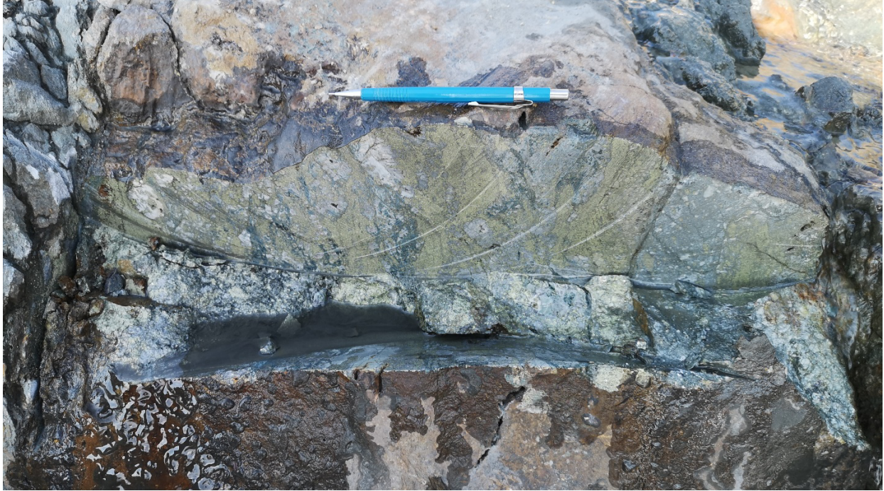
Photo 1: 50-cm Channel Sample OR-23-01 hosting semi-massive to massive pyrite and chalcopyrite.